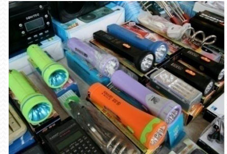
Low cost LED torches for sale in Kenya