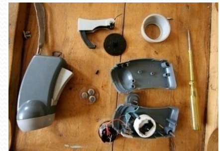
Counterfeit LED torch (3 non-rechargeable batteries; non- functional mechanical charger)